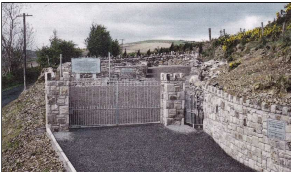
Curreeny Hedge School Monument

The occasional records we come across handwritten by Kennedys or containing their signatures indicate that they received schooling long ago when it was forbidden for them to be taught. Perhaps some of your ancestors received their schooling at the hedge school.