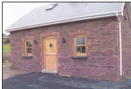
Renovated Kennedy Drummer Cottage at Foilduff