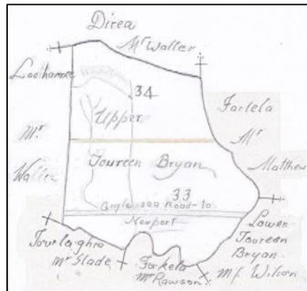
Toureenbrien Upper Map. Late 1700s.

Close examination of the 1769 Warter Wilson Estate map has resulted in an explanation of the appearance of two sections marked "Anglesey Road" (completed 1830) joined by dotted lines. Further examination of the individual surveyor's map of Toureenbrien on the bottom of p296 of The Mountainy Kennedys also shows the Angle sea Road to Newport (sic).