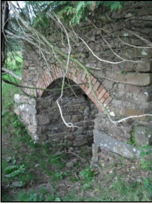
The Lime Kiln at Toureenbrien