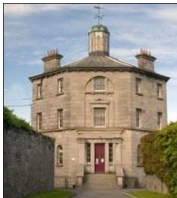
Nenagh Heritage Centre

The Nenagh Heritage Centre is located in the Governor's House, Kickham Street, Nenagh, and is open Monday to Friday from 10am to 4pm. Admission is free.