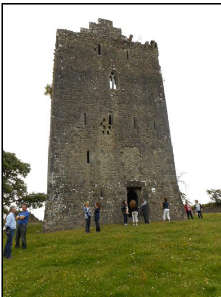
Some of the tour group at Lackeen Castle