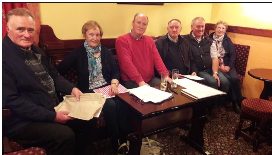
IKHG committee members taking a short break.