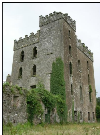
Cloghenane Castle (Castle Otway) near Templederry, Co. Tipperary