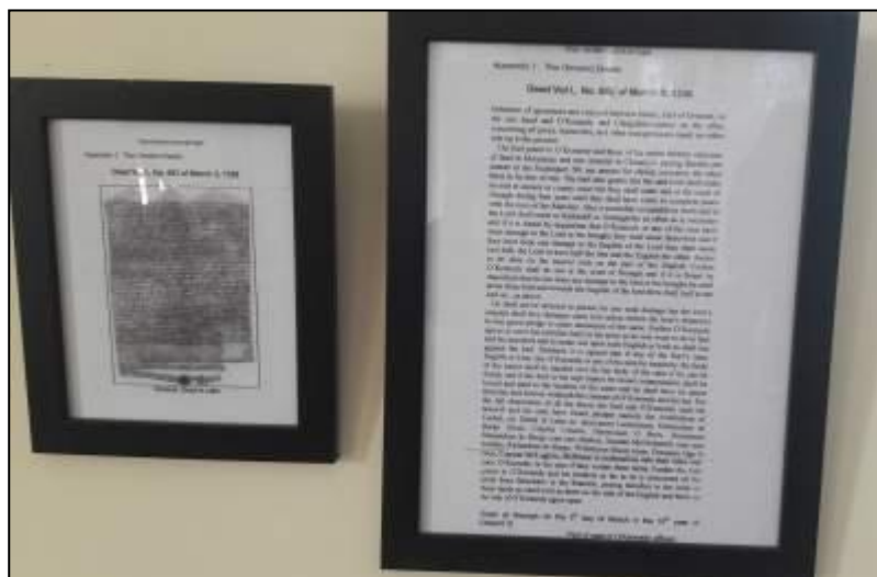
Copies of Ormond Deeds on display in Nenagh Heritage Centre